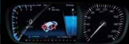
Door Open Warning