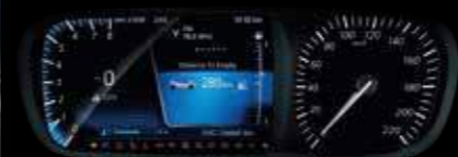
Cruise Control and Navigation