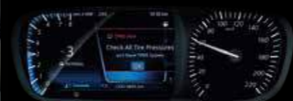
Tire Pressure Monitoring System (iTPMS)