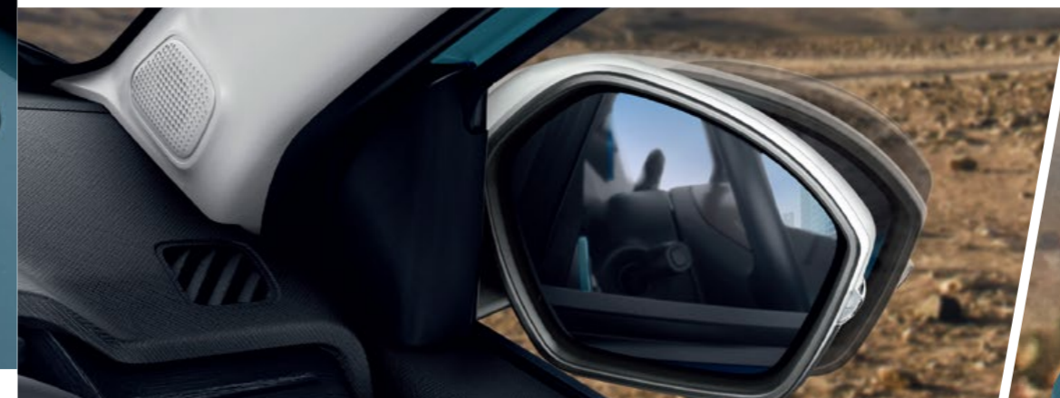
AUTO FOLD ORVM