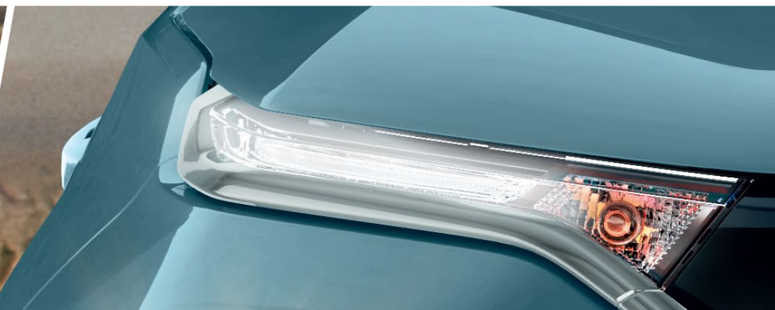
SIGNATURE LED DRLS