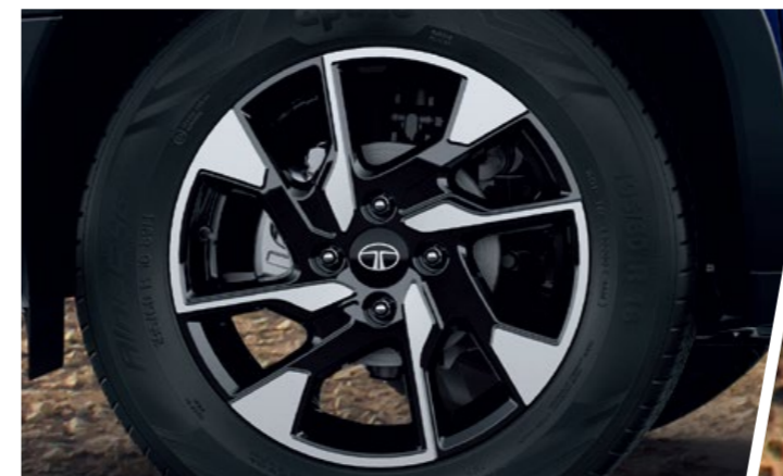
R16 DIAMOND CUT ALLOYS